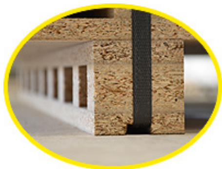
Grooved to allow strapping