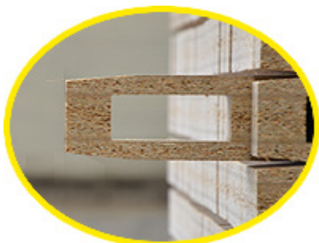
Extremities can differ to compensate product irregularities

We offer industry specific solutions to secure and protect your goods during handling, storage and transport: